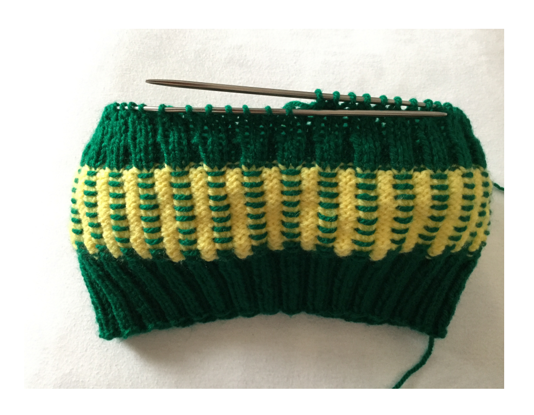
Page 7 of 9