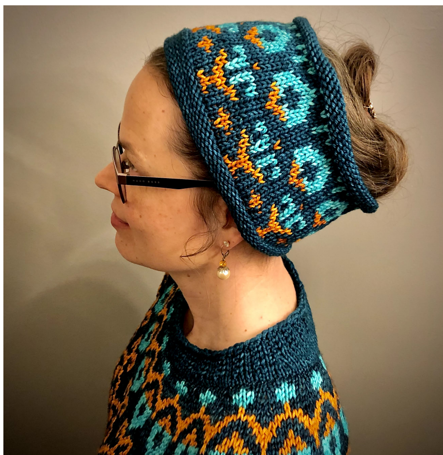
Headband and sweater

This headband is based on my Art nouveau fairisle sweater and can either be used as a gauge swatch for the sweater pattern, or as a garment in its own right.