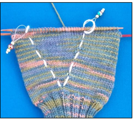
Above, I have stitched with contrasting yarn along the two diagonal rows of M1 increases just to show the gusset.

Repeat Rounds 8 thru 10 until you have 19 (21, 23) sts between the two markers. End after working a Round 10. You will have a total of 79 (85, 91) sts.