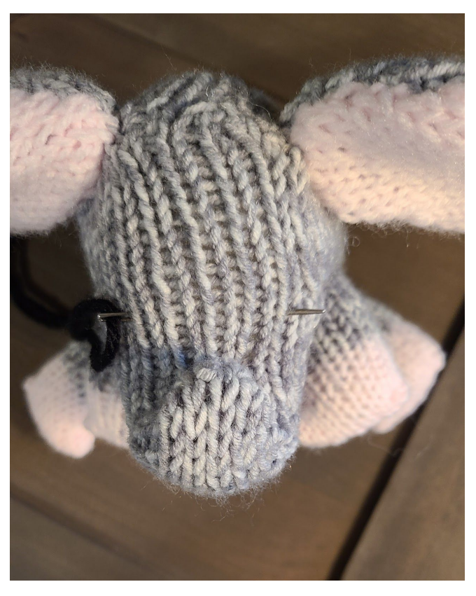
Have fun with it. Don't be afraid to tug and pull on the yarn and stuffing to create the effect you are looking for.

Take black yarn and thread through from one side of the face, (where the trunk begins and above where the seams meet) to the other side of the face. Continue sewing back and forth until the eyes are big enough. This tension pulls the face together and forms the shape of the elephant's face. You could also use safety eyes instead.