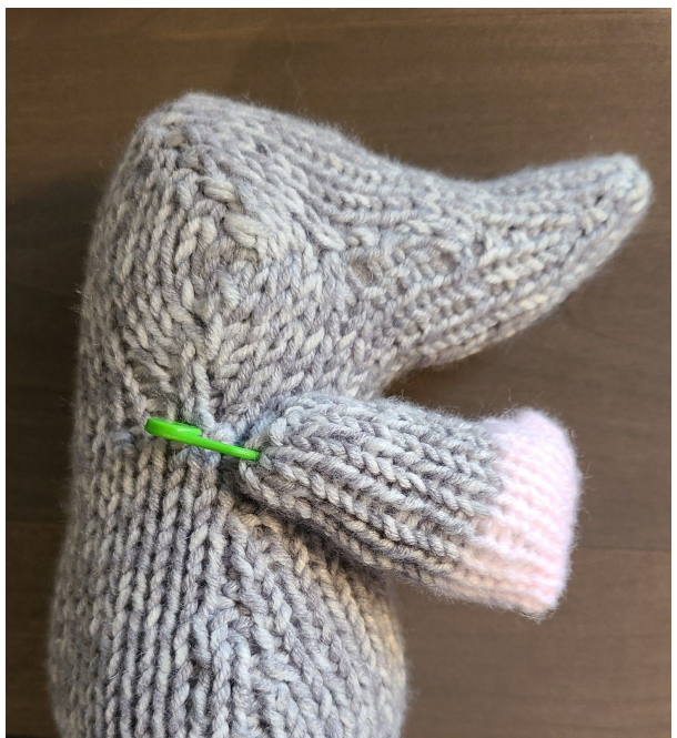
Sew the tail together along the seam, stuff and sew onto the body.