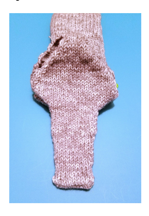
Next sew the top seam of the head together.

Starting at the trunk use matching yarn to sew the end together. Sew the sides of the trunk together on both sides of the face.