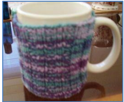
Sample knit by Courtney Quintana

Continue with instructions for both sizes below.